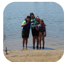
JOIN THE CONVERSATION