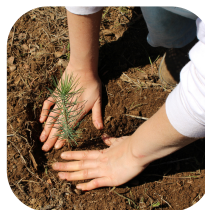
GUIDE TO GIVING